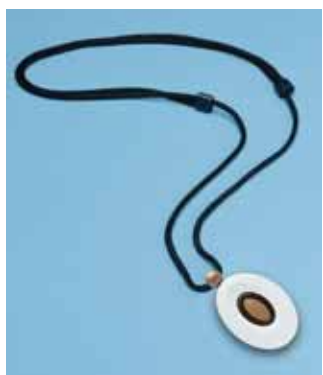
Lifeline users wear a small personal help button that they push when they need assistance.

For more information, call Northwestern Memorial Hospital's Health Resources and Physician Referral Service at 312-926-8400. For a limited time, new subscribers who call this number will receive free service activation. M